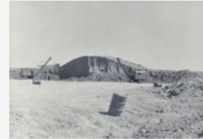
Nagden Bump whilst it was being levelled after the 1953 Great Flood